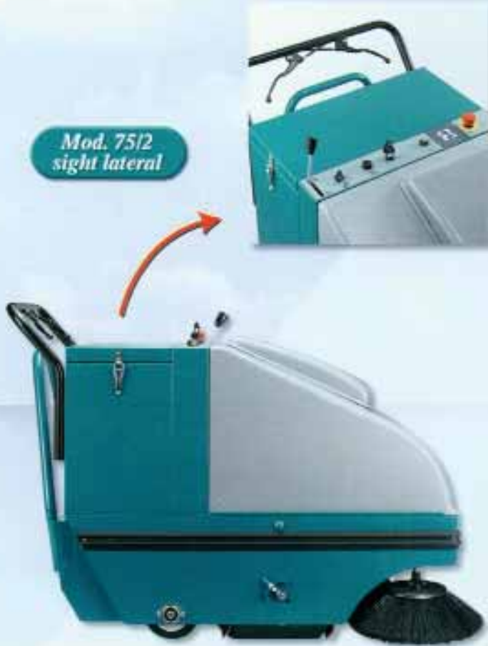
Mod. 75/2 sight lateral

For cleaning any type of industrial premises, warehouse or for outdoor use