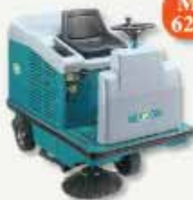
Mod. 95 6200 m 3 h