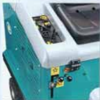
Mod. 95 sight lateral

For cleaning any type of industrial premises, warehouse or for outdoor use