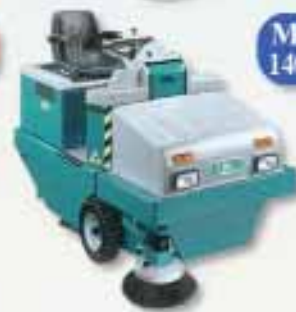
Mod. 125 14000 m 3 h