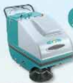
Mod. 75 3400 m 3 h