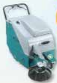
Mod. 50 3000 m 3 h

High quality manufacturing offers comfort and easy handling, making the machine safe and productive.